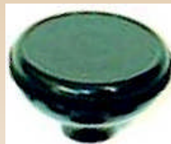
C68 and C71 (Red Only)