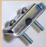
Connector Fitting C66